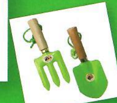
Trowels & Spades