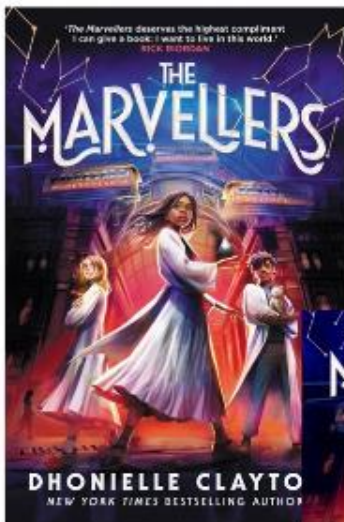
ebook and eaudiobook